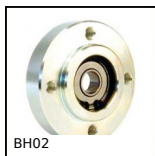
BH02 Single housed bearing assembly, Bearing secured with circlips