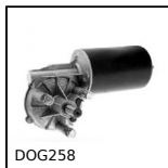
DOG258 Motor-gearbox 12V and 24V DC, from 12 to 15 Nm