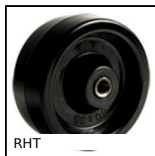
RHT High Temperature wheel, up to 200kg