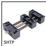
SHTP Drylin® Linear table, Economy range