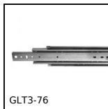
GLT3-76 Telescopic drawer,