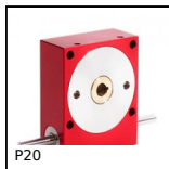
P20 Worm and wheel gear reducer, up to 5 Nm