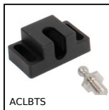
ACLBTs Spherical ended stop for aluminium profile, Spherical ended stop