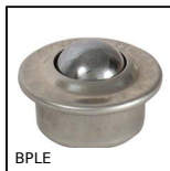
BPLe Ball transfer unit push fit, Light