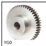
YG0 HEAVY DUTY spur gear, Steel 35NCD6