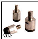
VTAP Magnetic head screw, With rubber coating With rubber coating