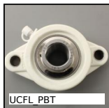
UCFL_PBT Stainless steel/Polymer flanged bearing, Polymer and stainless steel