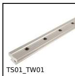
TS01_TW01 Drylin® T linear slide, up to 7000 N