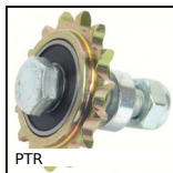
PTR Idler chain sprocket, For standard applications