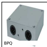
BPQ Quadro linear ball bearing unit, Included 4 linear ball bearings