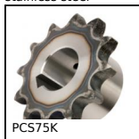
PCS75K Chain sprocket with hardened teeth, 19.05mm (DIN12B-1)