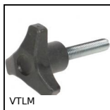
VTLM 3 lobed handle, Polyamide - Steel