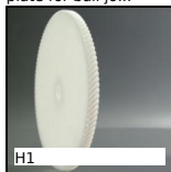
H1 Crossed helical gear crossed axis at 90°, Machined plastic (delrin)