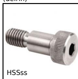
HSSss Stainless steel shoulder screw ISO7379, Stainless steel ISO 7379