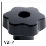
VBFP Small 6 lobe threaded handle - female, Duroplast - Brass