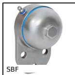
SBF Sealed flange bearing unit for Food Industry, cover