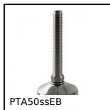
PTA50ssEB Articulated foot with sheet metal base Ø50, Articulated foot