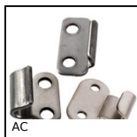
AC Strike for toggle latch, 12,13,18 and 20mm