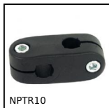
NPTR10 Adjustable cross clamp, Adjustable