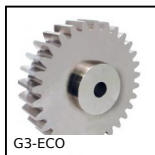
G3-ECO Eco range Spur gear, Steel C45