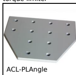
ACL-PLAngle Joining plate for aluminium profile,