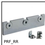
Coupling bar for aluminium profile, Coupling bar