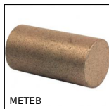
Self-lubricating blanks, Bronze BP25