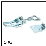
Adjustable latch clamp with strike plate, Stroke from 117,4mm to 128mm