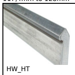
Half-rail guide, Rail