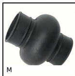
M Bellows cover, Accessory: