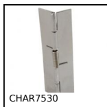
Spring hinge, welded