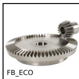
Eco. range steel bevel gear, 4:1