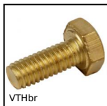
Hexagonal headed screw VTH - DIN933, Brass