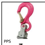
PPS Lifting ring, Universal threaded