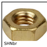
Hexagonal nut DIN934, Brass