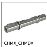
CHMX_CHMDX Shaft for worm and wheel reducer CHMR and CHM, CHMR and CHM gearbox...