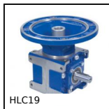
HLC19 Right angle spiro bevel gearbox, Up to 43Nm