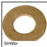
SHWbr Washer - DIN125, Brass