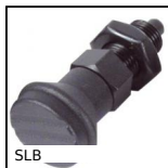
Indexing plunger, steel class 5.8