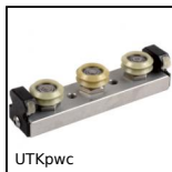
UTKpwc Utilitrak® 3 wheels carriage, Polymer series V wheels