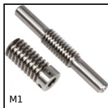
Worm and wheel set, Non hardened steel