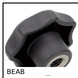
BEAB Knob star grip antibacterial, Star, anti-bacterial