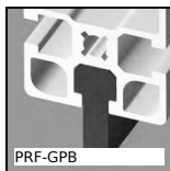
PRF-GPB Guide for aluminium profile, Rail for 8mm wide slots