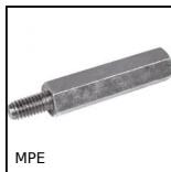
Hexagonal spacer, Steel