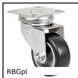
RBGpl Swivel castor with plate, Steel - grey rubber