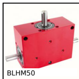
Right angled gearbox, double output shafts, up to 30 Nm