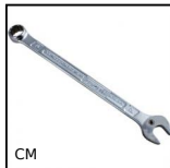
CM Tools Hygienic Usit® and Hygienic Design®, Combination spanner