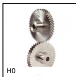
Crossed helical gear crossed axis at 90°, Steel 20NCD2