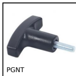
PGNT Thermoplastic T handle, With threaded spindle