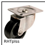
RHTplss High Temperature Castor, up to 200kg