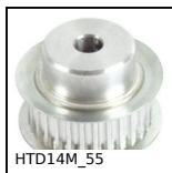
HTD Heavy duty timing pulley, HTD14 Steel