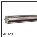
Stainless steel splined shaft, Stainless steel