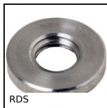
RDS Safety washer Hygienic Usit®, Stainless steel