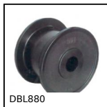
Idler for slat top chain, Ranges 880 and 881