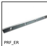
PRF_ER Joining bar for aluminium profile, joint bar