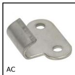
Strike for toggle latch, 15mm