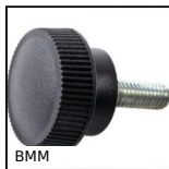
BMM Knurled knob - male, Knurled