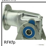
RFKfp Stainless steel gearbox - accessories,