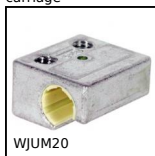
WJUM20 Drylin® W bearing block, Slide