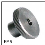
EMS Stainless steel knurled thumb nut, Knurled