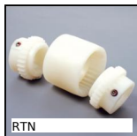
RTN BoWex® curved tooth gear coupling, Nylon