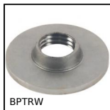
BPTRW Cap for round tube to be welded, To be welded