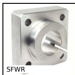
SFWR End support, Surface mounting