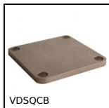
Sliding lock adjustment system, Blocking wedge