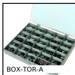
Box set of Nitrile O- rings in nitrile, 2.90 x