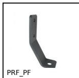
Anchoring bracket for aluminium profile, Anchor