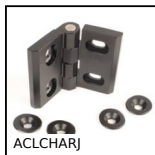
Hinge for aluminium profile, Adjusts in 2 directions