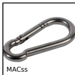
Stainless steel carabiner, Stainless steel