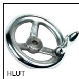
Spoked handwheel with handle, Aluminium