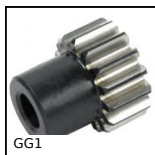
Ground spur gear, Heat treated steel