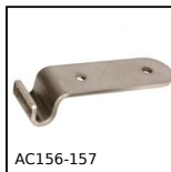
Strike for toggle latch, 25.5mm