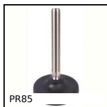
Articulated foot Ø83, Ø 83