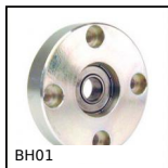
BH01 Single housed bearing, Bearing fitted with adhesive