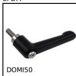
Accessories, Clamping lever