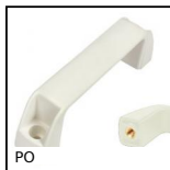
Pull handle - Multi-sector, Tapped recessed insert