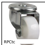
Swivel castor with central hole, Steel - Polyamide