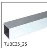
Square Tube, Aluminium or Stainless steel