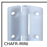
CHAFR-MINI Miniature friction hinge, Friction