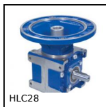
Right angle spiro bevel gearbox, Up to 182Nm