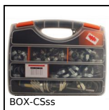
BOX-CSss Hose clamp, Box set of stainless steel hose clamps