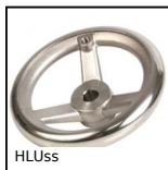
Spoked handwheel, Stainless steel 316