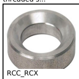
RCC_RCX Spherical tilt washer - DIN6319, concave