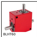
Right angled gearbox, from 26 to 70 Nm