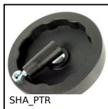
Handwheel with folding handle, Polyamide