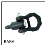
Ball pin lifting ring, Steel