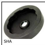
Handwheel without handle, Polyamide