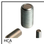
HCA Magnetic screw with socket, Steel