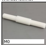
M0 Worm and wheel set, Machined plastic