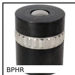
BPHR Ball transfer unit housed spring loaded, High