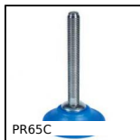
BR65C Half-articulated foot Ø 65, Ø 65