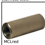
MCLred Reducing sleeve female/female,