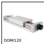
DOMI120 Domino 120 adjustable slide, Slide DOMILINE 120 with