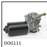
DOG111 Motor-gearbox 12V and 24V DC, from 1.5 to 6 Nm