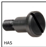
HAS Captive C washer, Slotted flat headed shoulder screw