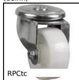
Swivel castor with central hole, Steel - Polyamide