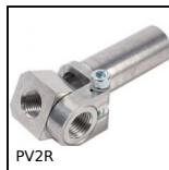
Adjustable suction-cup support, Increased grip