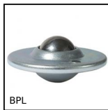
Ball transfer unit light duty, Light