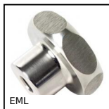
Stainless steel hexagonal headed thumb nut, Lobed handscrew