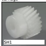
Parallel axis helical gear, Machined plastic (delrin)