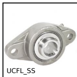
Stainless steel flanged bearing, Stainless steel