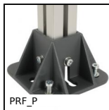
PRF_P Anchor foot for 45x45 profile, Anchor foot