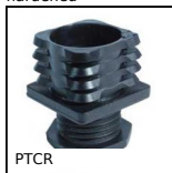
PTCR Adjustable furniture foot, square tube