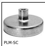
PLM-SC Magnetic stud with threaded hole, With threaded hole