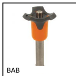
BAB Hardened Stainless steel ball pin, Stainless steel hardened