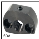
SDA Locking bolt support bracket, Mounting holes parallel to locating bolt