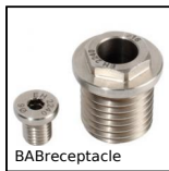
BABreceptacle Ball pin socket, Socket