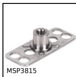
MSP3815 Masterplate® glueable insert rectangular, rectangular with tapped i...