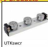
UTKswcr Utilitrak® 3 wheels carriage, Steel roller carriage