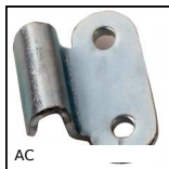
AC Strike for toggle latch, 15mm