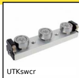
UTKswcr Utilitrak® 3 wheels carriage, Steel roller carriage