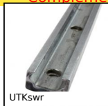
UTKswr Utilitak® V rail, V rail