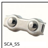
SCA_SS Stainless steel flat cable clamp, Stainless steel