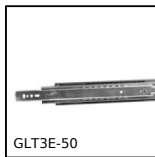
GLT3E-50 Telescopic drawer,