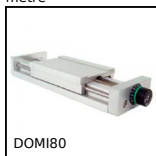
DOMI80 Domino 80 adjustable slide, Slide DOMILINE 80