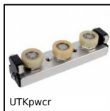
UTKpwcr Utilitrak® 3 wheels carriage, Polymer roller carriage