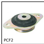
PCF2 Conical flexible mount, Oval base plate