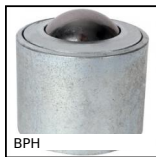
BPH Ball transfer unit plain fit, High