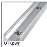
UTKpwr Utilitak® V rail, V rail