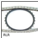
RLR Roll-Ring® chain tensioner, Roll-Ring® Self-adjusting