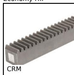
CRM Moulded nylon rack, Nylon