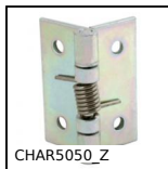
CHAR5050_Z Spring hinge, screwed