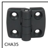
CHA35 Hinge for aluminium profile, Hinge