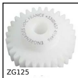
ZG125 Plastic spur gear, Machined plastic (delrin)