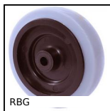
RBG Wheel, Grey rubber - Polypropylene rim