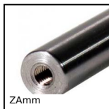
ZAmn Shaft for linear guides, Hardened ground steel