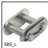
SBS_L Chain link, Stainless steel