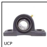
Cast iron pillow block bearing, Cast iron