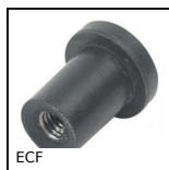
Well nut, Chloroprene elastomer