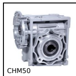
CHM50 Worm and wheel gear reducer, up to 107 Nm