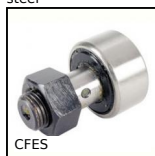
Eccentric cam follower, Eccentric