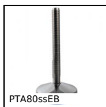
Articulated foot with sheet metal base