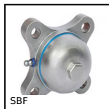
Sealed flange bearing unit for Food Industry, cover