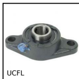
Cast iron flanged bearing, Cast iron