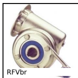
RFVbr Stainless steel reaction arm, Reaction arm