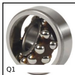
Self-aligning radial ball bearing, Steel