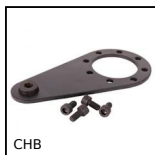
Reaction arm, CHB gear reducers reaction arm