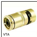
VTA Vari-Tork® slip friction clutch, 0.53 to 1.32 Nm