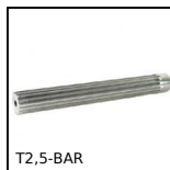
T type tooth bar stock, T2.5