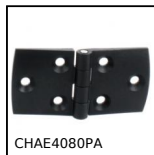
CHAE4080PA Symmetrical decorative screwed hinge, Polyamide