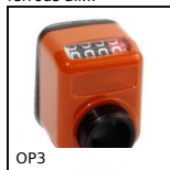
OP3 Mechanical digital position indicator, 4 numbers