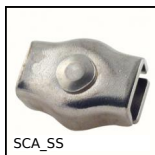
SCA_SS Stainless steel flat cable clamp, Stainless steel