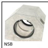
NSB Standard linear bearing housing, Closed - Long