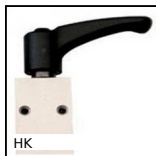
HK Manual locking clamp, Manual locking clamp T