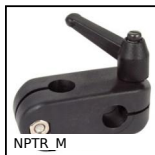
NPTR_M Adjustable cross clamp, Adjustable