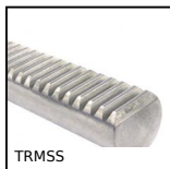
TRMSS Spur round rack, Stainless steel - module 1-5