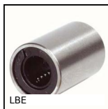
LBE Miniature closed linear bearing,