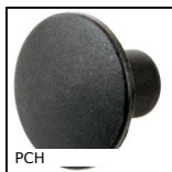
PCH Knob for gripping, Mushroom