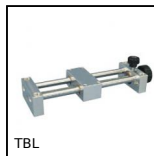
TBL Mini leadscrew table with metric thread, 1kg