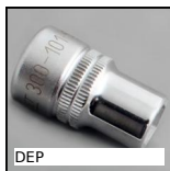
DEP Tools Hygienic Usit® and Hygienic