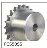
PCS50SS Chain sprocket - Stainless steel, 12.7mm (DIN 08B-1)