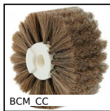
BCM_CC Modular cylindrical brush, Horsehair bristles