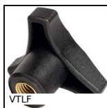
VTLF 3 lobed handle, Polyamide - Brass