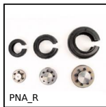
PNA_R PERIFLEX elastic coupling, Replacement tyre