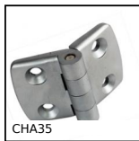
CHA35 Hinge for aluminium profile, Hinge