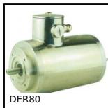
DER80 Stainless steel AC asynchronous motor 0.55 - 0.75kW, 0.55 to 0.75kW