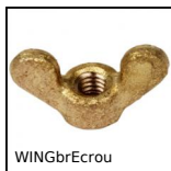
WINGbrEcrou Manually tightened wing nut DIN315,