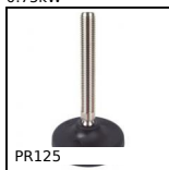
PR125 Articulated foot Ø123, Ø 123