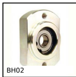
BH02 Single housed bearing assembly, Bearing secured with circlips