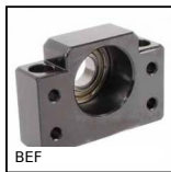
BEF Bearing housing for miniature ballscrew, Bearing housing