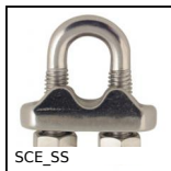
SCE_SS Stainless steel U-shaped clamp, Stainless steel