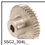
Stainless steel spur gear, Stainless steel 304L