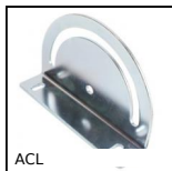
Joints for aluminium profile, Variable angle hinge