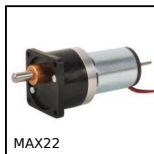
Motor-gearbox 12V and 24V DC, from 0,07 to 0,2Nm