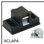
Magnetic stop for aluminium profile, Magnetic stop