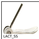
Adjustable Stainless steel cam lever, Male