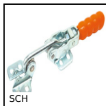
Horizontal hook toggle clamp, Horizontal Hook clamp - steel