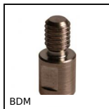
Pin for magnetic bush, Fast and light magnetic locking