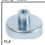
Flat magnet, Flat magnet with threaded