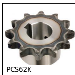
Chain sprocket with hardened teeth,