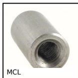
Cylindrical threaded sleeve, Cylindrical - stainless steel