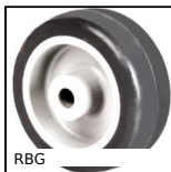
Wheel, Grey rubber - Polypropylene rim