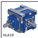
Right angle spiro bevel gearbox, Up to 43Nm