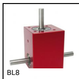
Right angled gearbox, from 0.20 to 2 Nm