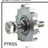
Idle chain sprocket, For hostile environments