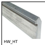
Half-rail guide, Rail