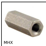
Hexagonal threaded sleeve, Hexagonal - stainless steel