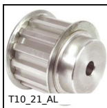
T type timing pulley, Economy range - T10 aluminium