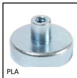
Flat magnet, Flat magnet with threaded hole