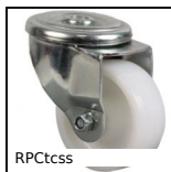
RPCtcss Swivel castor with central hole, Stainless steel - Polyamide