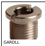
Mounting sleeve for lock pin, Nickel-plated steel or Stainless steel