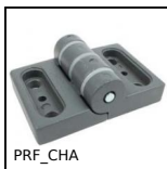
Hinge for aluminium profile, Surface mounting hinge