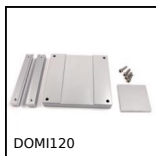
DOMI120 Accessories, Plate