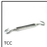
TCC Rigging screw (hook/hook), Steel