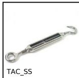
TAC_SS Stainless steel rigging screw (hook/eye), Stainless steel