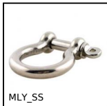
MLY_SS Stainless steel bow shackle with eye bolt, Stainless steel