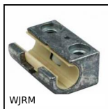
WJRM Drylin® W hybrid bearing block, Hybrid bearings