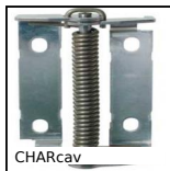
CHARcav Spring hinge, to install