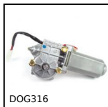
DOG316 Motor-gearbox 12V and 24V DC, from 1.5 to 2 Nm