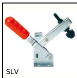
SLV Vertical toggle clamp, Vertical Lever Clamp - steel