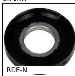
RDE-N Sealing washer Hygienic Usit®, Stainless steel - Black