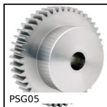
PSG05 Spur gear - precision range, Case hardened steel 20NCD2