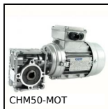
CHM50-MOT Asynchronous AC motorgearboxes 0.18 to 0.75kW, 0.18 to 0.75kW