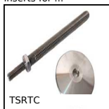
TSRTC Stem support for castor, For swivel castor with central