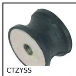
Stainless steel diaboloid shaped elasto mount, Stainless steel