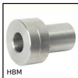
Adjustment bushing for half-rail guide, Adjustment bushing