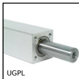
Actuator guide kit, Long bearing