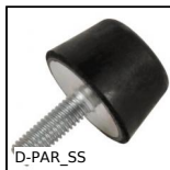
Stainless steel progressive stop, stainless steel