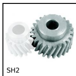
Parallel axis helical gear, Steel 20NCD2