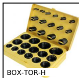
Box set of Nitrile O-rings in nitrile, 3.00 x 2.00mm to 45.20 x 4.00