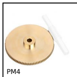
Worm and wheel set, Bronze