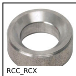
Spherical tilt washer - DIN6319, concave