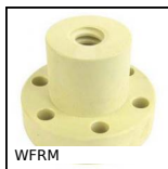
WFRM Flanged polymer nut, Polymer (Iglidur®) - 1 thread