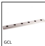
GCL Linear ball slide Eco Range, economy range