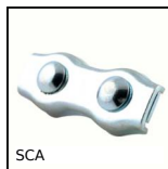
SCA Flat cable clamp, Steel