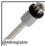
BABreglable Adjustable ball pin hardened stainless steel, adjustable