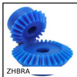
ZHBRA Plastic bevel gear, 1,25:1 2:1 3:1