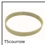
T5courroie T type timing belt, T5 Steel cored polyurethane