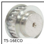
T5-16ECO T type timing pulley, Economy range - T5 aluminium