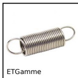
ETGamme Extension springs DIN2097, DIN 2097