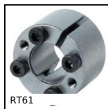
RT61 Self-centering locking Assembly, Medium/low torque