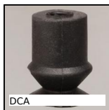
DCA Suction cup, 1.5 bellows, nitrile