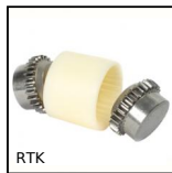
RTK BoWex® curved tooth gear coupling, Nylon and steel