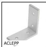
ACLEPP Right angled bracket for aluminium profile, 4 holes