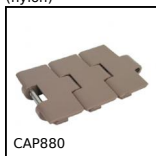
CAP880 Side flexing slim slat top chain acetal,