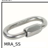
MRA_SS Stainless steel Quick link, Stainless steel