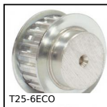
T25-6ECO T type timing pulley, Economy range - T2.5 aluminium