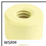
WSRM Cylindrical polymer nut, Polymer (Iglidur®) - 1 thread