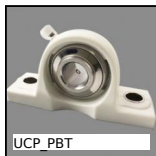
UCP_PBT Stainless/Polymer pillow block bearing, Polymer and stainless steel