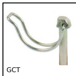
GCT Pipe linch pin, Tube linch pin