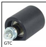
GTC Belt tensioner, For standard applications