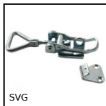
SVG Adjustable latch clamp with strike plate, Stroke from 118mm to 130,5mm