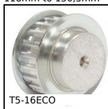
T5-16ECO T type timing pulley, Economy range - T5 aluminium