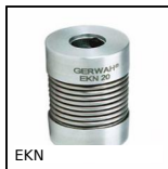
EKN Bellows coupling Gerwah® , from 0.5 to 12Nm