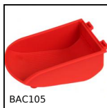
BAC105 Storage bin, 8mm