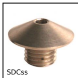
SDCss Positioning sleeve for indexing pin, For pin Ø4 to Ø12