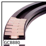
GCB880 Curved track for slat top chain, Ranges 880 and 881