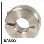
BAGSS Stainless steel Clamping collar, Stainless steel