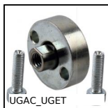
UGAC_UGET Actuator guide kit, Coupling for threaded cylinder end