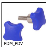
PDM_PDV Detectable plastic palm grip, blue thermoplastic