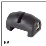
BRI Panel holder, Panel holder