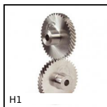
Crossed helical gear crossed axis at 90°, Steel 20NCD2