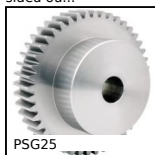
Spur gear - precision range, Case hardened steel 20NCD2