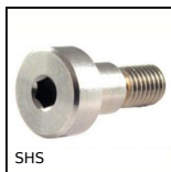
Shoulder screw stainless steel 303,