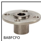
Ball pin socket, Mounting collar with a