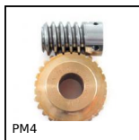
Worm and wheel set, Bronze