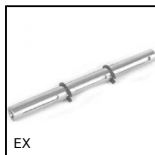
Optional shaft for E-type gear reducers, E Gearboxes double sided ou...