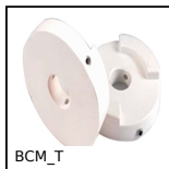
Driving collar, Driving collar