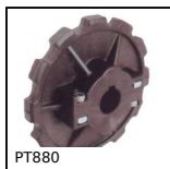
Drive sprocket for slat top chain, Range 880