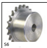
Chain sprocket - Stainless steel, 6mm (DIN 04-1)