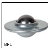
Ball transfer unit, Light