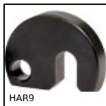
Captive C washer, DIN 6371