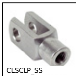
End fitting, Stainless steel - short range