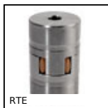
Rotex®, flexible, steel