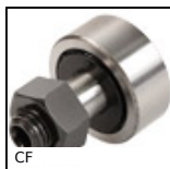
Cam follower, Standard - steel