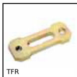
Tensioner plate, Fixed