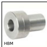
Half-rail guide, Adjustment bushing