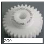
Spur gear, Machined plastic (delrin)