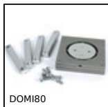
DOMILINE - Accessories, Turntable