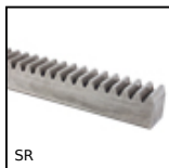
Rack, rectangular section, Stainless steel