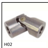
Universal joint - steel, Needle bearings - single