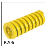
R206 Die spring ISO10243, Extra-heavy