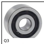
Q3 Double row angular contact ball bearing, Angular contact - Steel