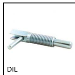
DIL Lever operated locking bolt, lever clamp