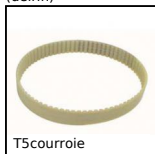
T5courroie T type timing belt, T5 Steel cored polyurethane