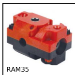
RAM35 Manual bevel gearbox, Bevel