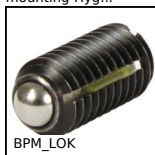
BPM_LOK Long-Lok slotted spring plunger with ball tip, LONG-LOK -