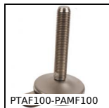
PTAf100-PAMF100 Articulated fixable foot with pressed base \varnothing 100 , \varnothing 100