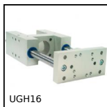
UGH16 H Type Guide units, For Ø12 and Ø16 actuators