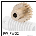
PW_PWG2 Wheel - precision range, Bronze