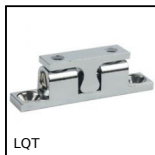
LQT Mechanical catch, Quick closing catch duty