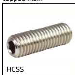
HCSS Set screw with hexagonal socket,