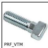
PRF_VTM Hammerhead screw, Hammerhead screw