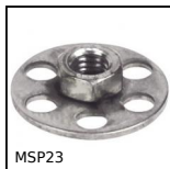
MSP23 Masterplate® glueable insert \varnothing 23, Cylindrical \varnothing 23 with tapped ins...