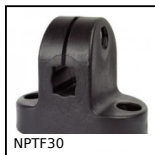
NPTF30 Fixed tube carrier, Fixed \varnothing 14 to \varnothing 20