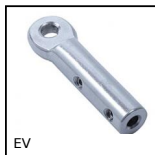
EV Stainless steel cable terminal, Eye version