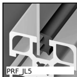
PRF JL5 Lip seal for panel, Door seal - Ø 5mm