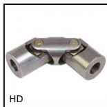
HD Double needle roller universal joint, Heavy duty