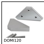
DOMI120 Connecting kits, XZ linking kit