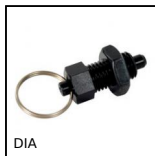
DIA Ring operated locking bolt, with ring