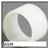
ASM Cylindrical polymer bush, Food grade polymer