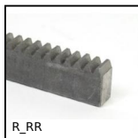
R_RR Narrow spur rack, Steel