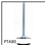
PTA80 Articulated levelling foot, pressed base Ø80, Ø 80