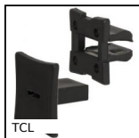
TCL T-Clip - Aluminium profile attachment, T-Clip