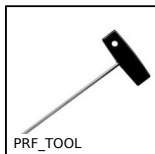
PRF_TOOL Assembly key for aluminium profile, Assembly key