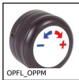
Numerical counter accessories, Operating knob