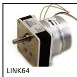
Synchronous AC Motor and- gearbox , from 1.3 to 6Nm