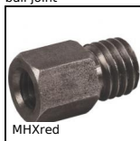
Reducing sleeve male/female, Hexagonal - steel