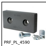
Joining plate for aluminium profile, Joint plate - 45x90