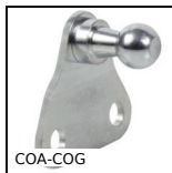
Surface mounting plate, Surface mounting plate for ball joint