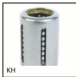
Linear bearing, Light