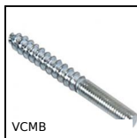
Dual-thread screw wood/metal, Steel