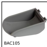
Storage bin, 8mm