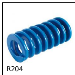
R204 Die spring ISO10243, Average