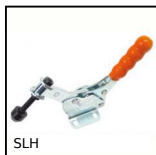
SLH Horizontal toggle clamp, Horizontal Lever Clamp - steel