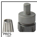
PRES Manual workbench press accessory for PRES-3HR end PRES-4HR, Tool hol...