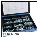
BOX-NINA Self locking nut - DIN985, Box set of steel nuts