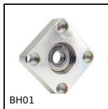
BH01 Single housed bearing, Bearing fitted with adhesive