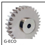
G-ECO Eco range Spur gear, Steel C45