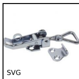
SVG Adjustable latch clamp with strike plate, Stroke from