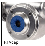
RFVcap Stainless steel protective cover, Open protective cover