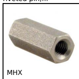
MHX Hexagonal threaded sleeve, Hexagonal -