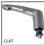
CLAT Clamping lever Hygienic Usit® - male, Stainless steel