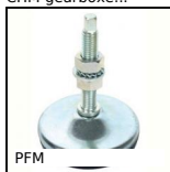
PFM Fixed levelling foot, Flanged plate