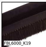
FBL6000_K19 Brush strip per meter horsehair fibres Ø0.2,