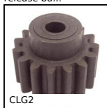
CLG2 Moulded plastic spur gear, Moulded plastic (nylon)