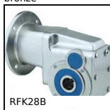
RFK28B Hypoid gearbox - Stainless steel, up to 130 Nm