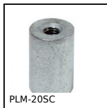
PLM-20SC Threaded cylindrical magnet, With threaded hole