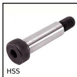
HSS Shoulder screw ISO7379, Hardened Steel class 12.9