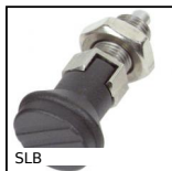
SLB Indexing plunger, stainless steel