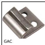
GAC Lock for latch clamp, Strike plate