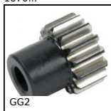
GG2 Ground spur gear, Heat treated steel