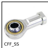
CFF_SS Female rod ends DIN ISO12240-4, Stainless steel / bronze - Economy r...