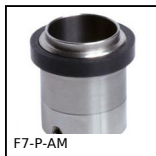
F7-P-AM Multifunction display, Magnetic ring