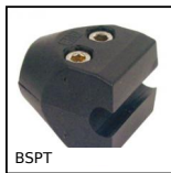
BSPT Single rod clip, Round