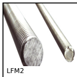
LFM2 Steel leadscrew, Medium carbon steel - 2 threads