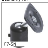
F7-SN Multifunction display, Articulated support