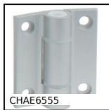
CHAE6555 Decorative screwed hinge, Aluminium