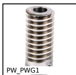
Worm - precision range, Steel