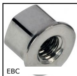
Cap nut Hygienic Design®, Compact