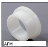
Flanged polymer bush, Food grade polymer