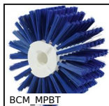
Modular cylindrical brush, PBT polyester bristles