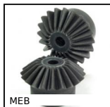
Moulded plastic bevel gear (nylon), 1:1