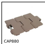
Side flexing slim slat top chain acetal, Narrow range 880