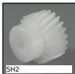
Parallel axis helical gear, Machined plastic (delrin)