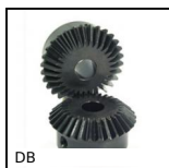
Steel bevel gear, 2:1