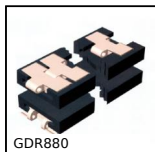
Straight track for slat top chain, Ranges 880 and 881