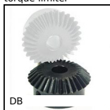
DB Steel bevel gear, 2:1