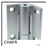
CHAFR Adjustable friction hinges, Friction