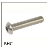
Socket head button screw, Stainless steel A2