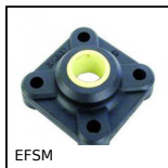
Igubal® flange bearing, Polymer