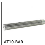
AT type tooth bar stock, AT10