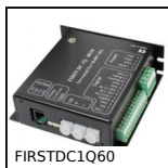
Speed controller 10A, 10 A