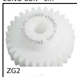
Plastic spur gear, Machined plastic (delrin)