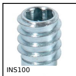
Self tapping inserts- coarse thread, Coarse thread