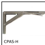
Folding bracket, For heavy loads