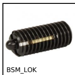
Long-Lok spring plunger with internal hexagonal socket, LONG-LOK - s...