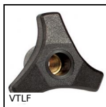
3 lobed handle, Polyamide - Brass