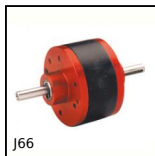
J66 Spur gear coaxial gearbox, from 0.90 to 2.80 Nm - In-line