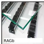
RAGb Cylindrical brush track, For gentle conveying and handling