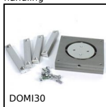
DOMI30 Accessories, Turntable