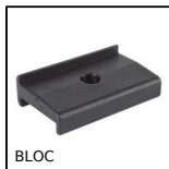
BLOC Doorstop, Doorstop