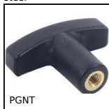
PGNT Thermoplastic T handle, With threaded insert